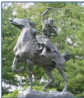
Sybil Ludington in Carmel . She rode horseback over night on April 26, 1777 to call our Colonel Ludington's Regiment to repel British at Danbury, CT