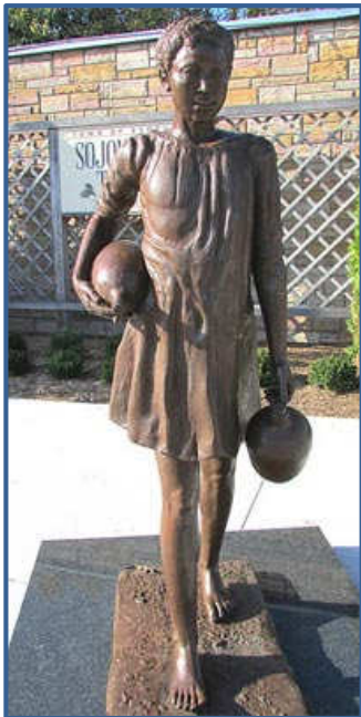
Sojourner Truth in Port Ewen

Appreciate our local monuments which depict Sojourner Truth in Port Ewen and Sybil Ludington in Carmel . ■