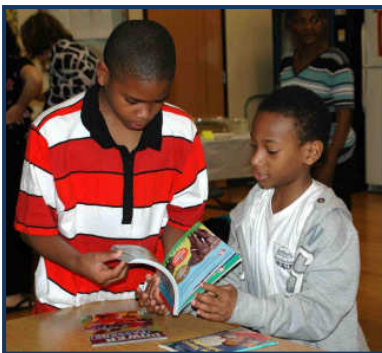
Two students from the Book Buddies program enjoying their Leading to Reading books

This year we donated books and reading materials to all of the Astor Pre-School Centers, Catharine Street Community Center, Hand in Hand, Tubman Terrace Afterschool Program, Grace Smith House, Abilities First, Rural and Migrant Ministry, Book Buddies, House of Hope, AgriBusiness Child Development Center, Poughkeepsie Day Nursery, Hudson River Lodging, AAUW Healthcare Initiative, and the Community Family Development Center. We’re gearing up for next year – join us!! ■